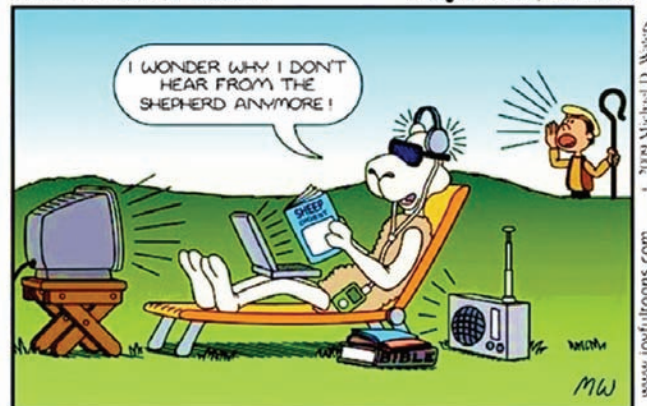
My sheep listen to my voice: I know them, and they follow me. - JOHN 10:27 NIV