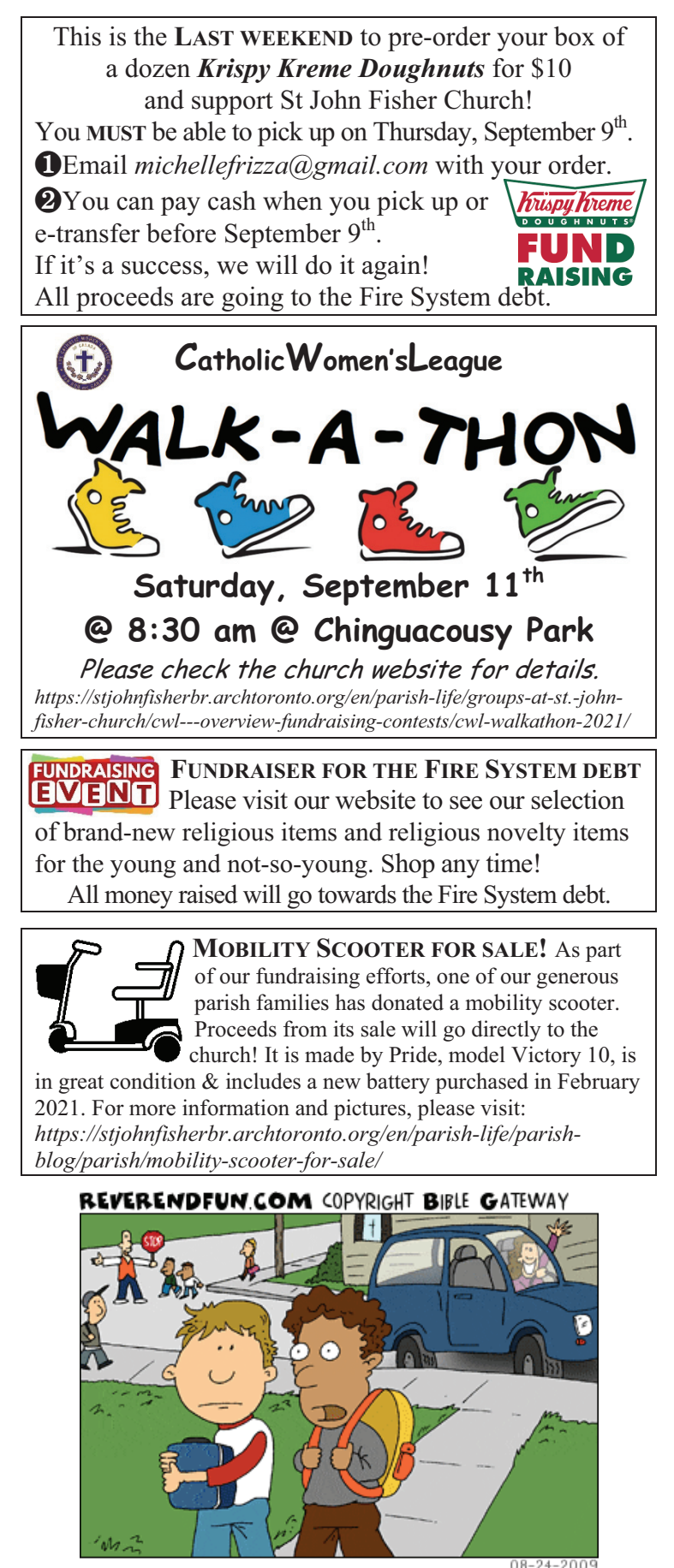
I don't understand how a benevolent God can let back-to-school happen to good people.

Catholic Conscience FEDERAL ELECTION RESOURCES The core of the heart FROM A CATHOLIC PERSPECTIVE With a federal election scheduled for September 20, Catholics are encouraged to learn more about the parties and candidates seeking our vote. Catholic Conscience is Canada's non-partisan Catholic civic and political engagement organization. They have prepared several resources that will assist Catholics in voter education and engagement in the days leading up to the federal election. These resources can be accessed at: