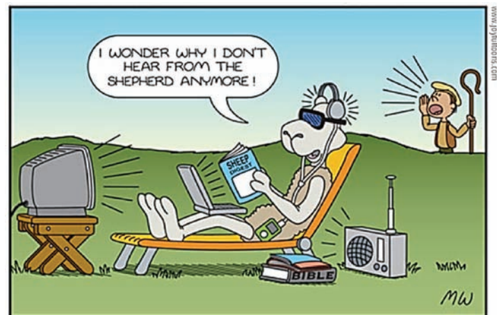
My sheep listen to my voice; I know them, and they follow me. | John 10:27