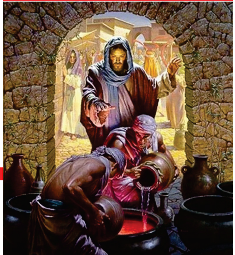
“The Wedding Feast of Cana”