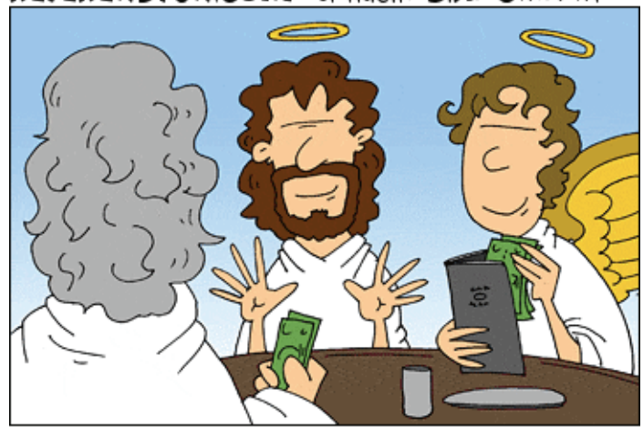
The Son and the Holy Spirit always pick up the check on Father's Day.