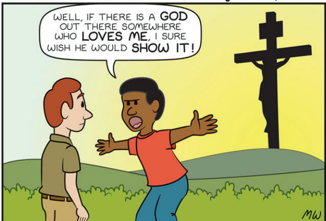
But God demonstrates his own love for us in this: While we were still sinners, Christ died for us. — ROMANS 5:8 NIV